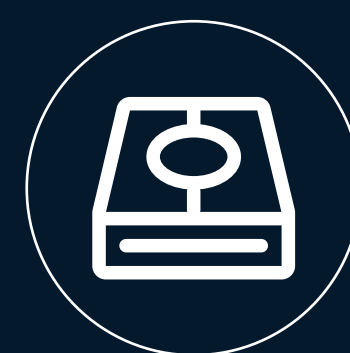
HDD storage expansion