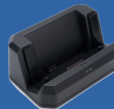
Docking Charger (Optional)