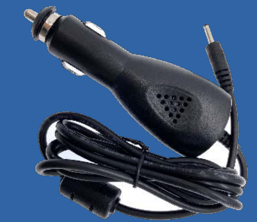
Car Charge (Optional)

* The technical specifications of this product are subject to change without prior notice