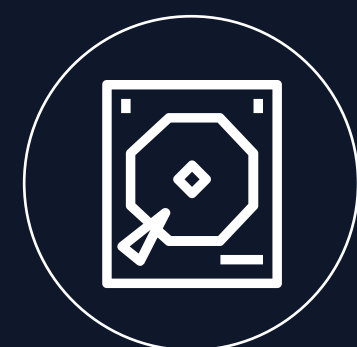
16GB RAM 128GB ROM