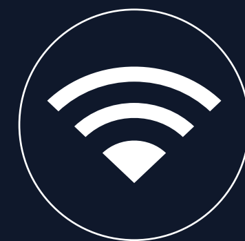
Dual-band Wi-Fi 5 /BT 5.2/4G