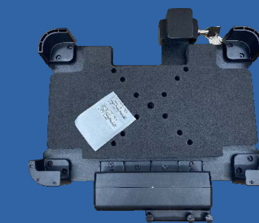
Vehicle Mount (Optional)