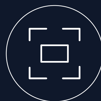
10.1-inch screen 1000 nits highlighting optional