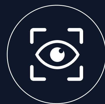
700 nits highlighting