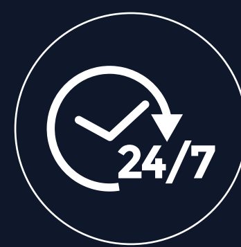
Running 24/7 without affecting reliability