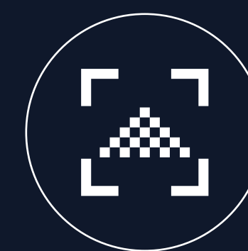
1920*1080 Screen resolution